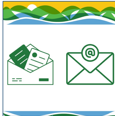
Correspondence & Email