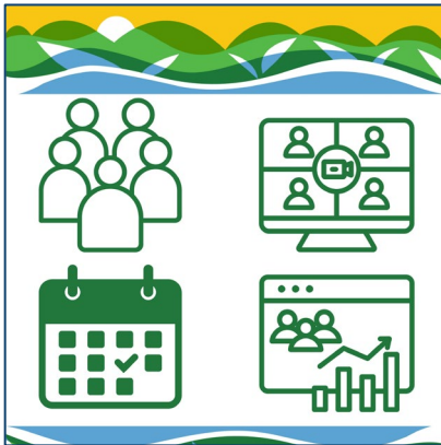
Appointments, Visitors & Webinars