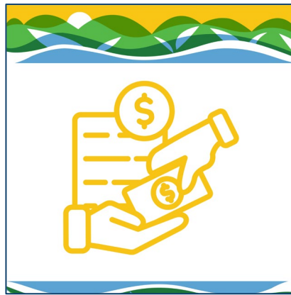
Employer Reporting Challenges