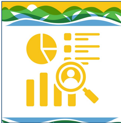
About Payroll & Employer Reporting